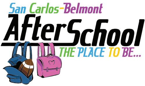
Photo Release Form

From time to time the After School staff takes pictures of the kids and their activities in promotional brochures, posters, and on our website (AfterSchoolKids.net). Please complete the form below and let us know whether or not we can include your child in these pictures. Thank you for your time and consideration.